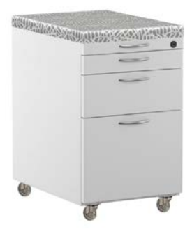
Pencil/Box/File 50 mm translucent casters