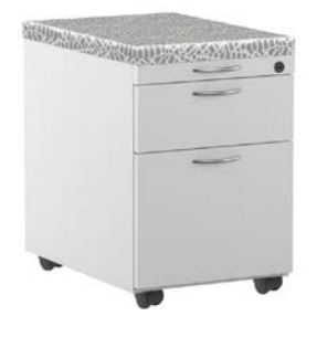
Box/File 37 mm black casters